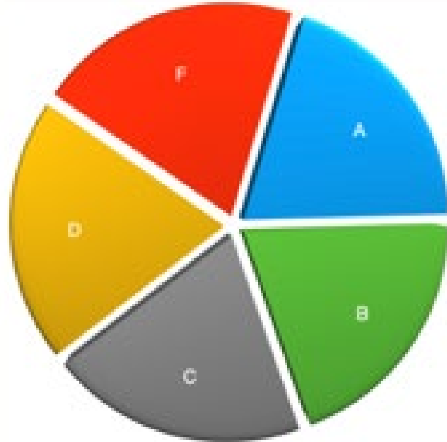
Zero to 4 scale only has 1 level of F